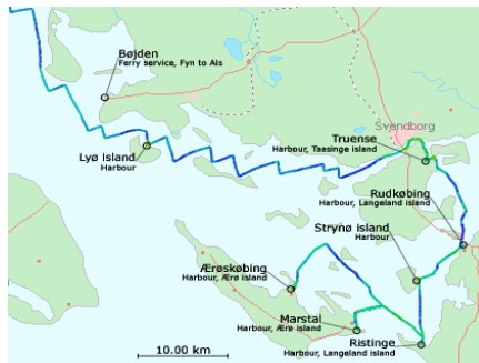
Fig. 1: A route of GPS waypoints

Waypoints are used by geographical positioning systems to save locations of interest [4] that may include checkpoints on a route or a significant ground feature to be avoided. They can be specified by manually entering latitude and longitude coordinates or they can be saved as the user passes close by a point of interest. Waypoints can be referenced according to distance and bearing to a previously saved waypoint, and they are designed to be shared across users and applications. Landmarks are features (e.g. tall buildings) that serve as reference points to guide navigation [10]. In comparison with waypoints, landmarks are typically not the goal of the navigation task. Waypoints are often gathered within routes (see Fig.1). A route provides a path from one point to another together with intermediate destinations (a sequence of waypoints).